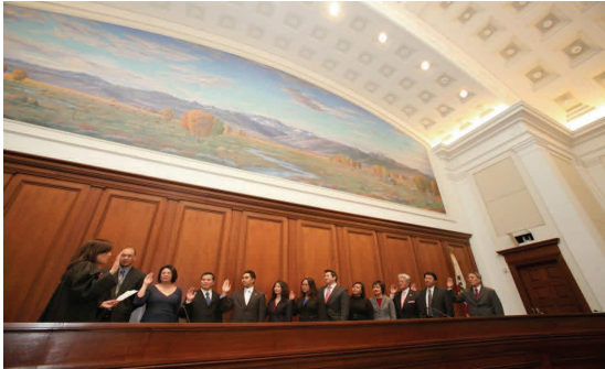
Chief Justice Tani Cantil-Sakauye administers the oath of office to the 2012 ABAS Board at the California Supreme Court.